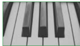
1000:1 contrast ratio

Technology from Texas Instruments produces a stunning 2500:1 contrast ratio for pin sharp graphics and crystal clear text. Crisper whites, ultra-rich blacks makes images come alive and text easier to read - ideal for business and education presentations.