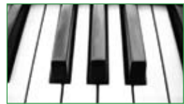
2500:1 contrast ratio